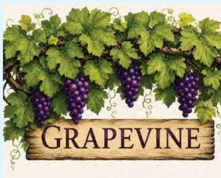
* Disclaimer: The pieces above are a work of satire. Any resemblance to anyone is purely coincidental

Hide and Seek: The Minister was here and during his two-day stay, he made himself visible everywhere—air, land and sea, drum beating and chest thumping about the 12 (in) glorious years of 'Melody king'. Followers and andhbhakts joined him in singing praise of the king. His sundry brags and blusters programmes were attended by a sizeable number of people from the ruling party. So much so, even some diehards of the opposition party were seen joining the chorus ostensibly to come out clean through the washing machine. But the biggest surprise has been the conspicuous absence of the man who had left no stone unturned to demand the ouster of the Numero Uno. That he had to bite the humble pie is no secret. Grapevine has it that the sulking man stayed away from the VIP visit as the latter had also undermined his demand.